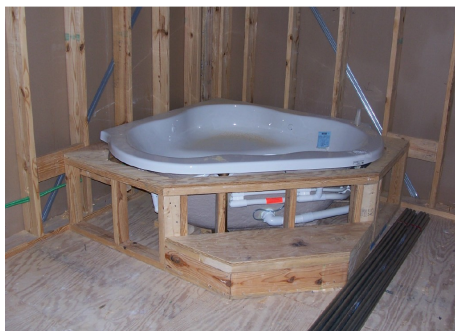
Whirlpool tub installation in new birth center