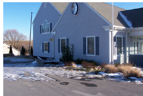
North side of new Birth Center